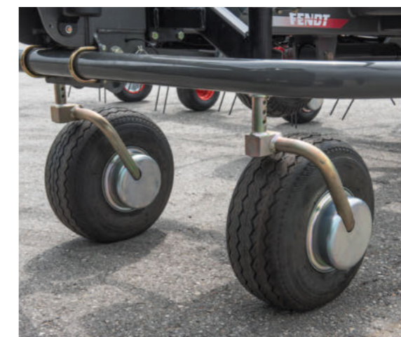
□ The optional mobile feeler wheels optimise the ground tracking, and ensure clean raking and sward protection. (Fendt Twister 901 T)