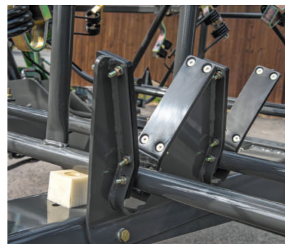
■ The Twister hoop guards, which are equipped with long-life bearings, fit perfectly into the special v-shaped brackets on the frame. (Only on Fendt Twister chassis version.)