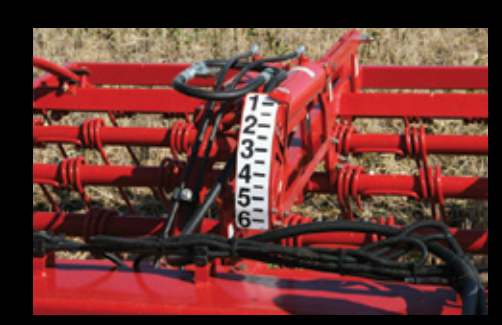
Hydraulic tine angle adjustment setting is conveniently visible from the tractor.

CORPORATE OFFICE & TRAINING CENTRE 2131 Airport Drive, Saskatoon, SK Canada S7L 7E1 Tel: 306.933.8585 Fax: 306.933.8626 U.S.A. Toll-Free: 1.866.663.8515 www.morris-industries.com Questions? email: info@morris-industries.com