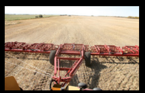
Available in working widths of 50 and 70 feet.