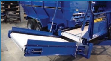
■ Pivoting cross conveyor extension for feeding over troughs and fences has two lifting rams, separate hydraulic motor and tracking strip on the belt