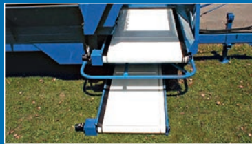
■ Optional 1200mm cross conveyor has a larger opening to help with feeding out square and round bales