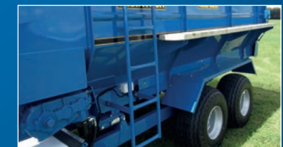
■ 250mm wide walkway helps with loading bales and minerals