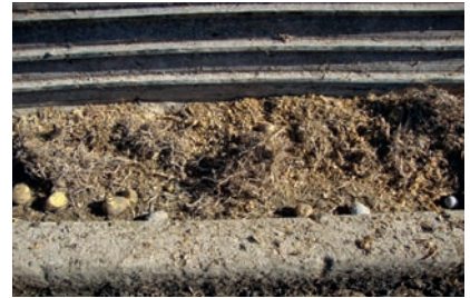
■ Feeding maize, potatoes and large square bales, the square bale is completely broken up