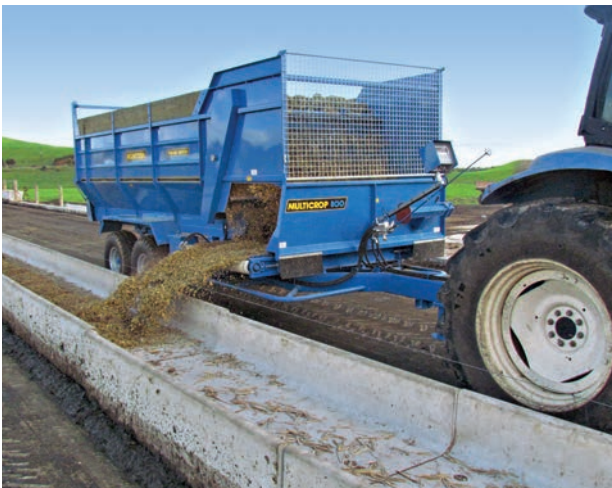
The long throw is ideal for feeding into troughs or under electric fences