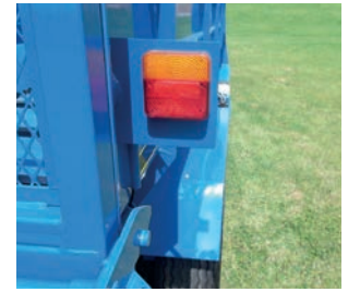
■ Optional LED taillights mounted high for better visibility