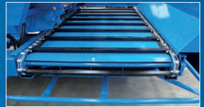
■ Chain cross conveyor option requires less maintenance than a belt conveyor and has a larger valve and separate speed control