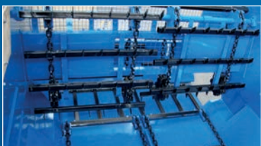
■ Four floor and/or four elevator chains optional on all wagons and standard on Titan 1700