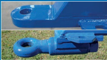
■ Standard plate tongue makes hitching up easier using the quick hitch. Optional swivel tongue is ideal for rougher country