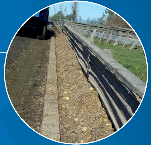
Feeding maize, potatoes and square bales