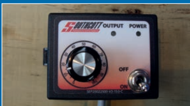
■ Electronic floor speed control mounted in tractor