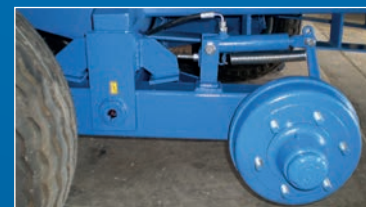
■ Brakes with extra adjustable external return springs to ensure brake pad release