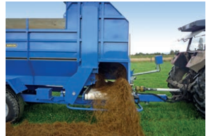
■ Augers completely break up round bales for even more feeding