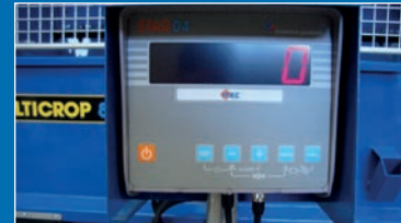
■ European load cells protected with steel covered load cell display and screen that turns to the side when loading