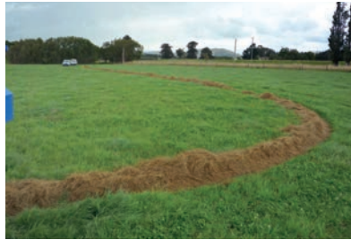
■ Feeds round bales in a long, even, continuous line – difficult to achieve with a conventional elevator