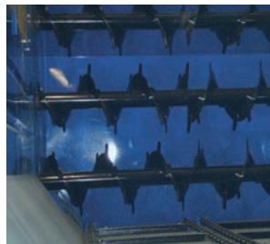
■ Three PTO-driven horizontal beaters