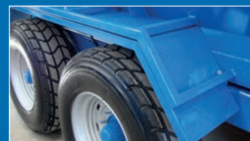
■ RHS mudguard protection