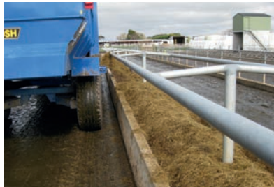
■ Feeding round bales into troughs with an even distribution