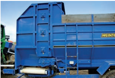
■ Side view showing beater attachment and hood, which channels feed onto the belt