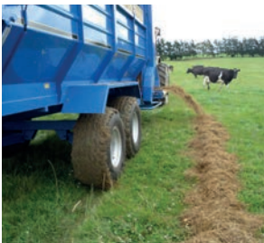
■ Long throw ideal for feeding into troughs