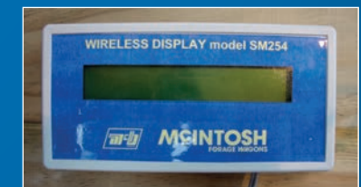
■ Remote load cell display mounted in tractor cab