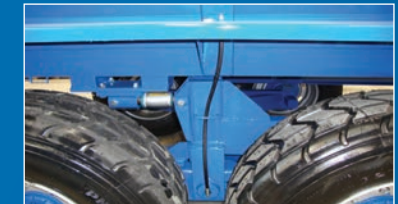
■ Optional grease line makes greasing of the axle pins a simple job, with no need to get under the wagon or remove mud from the grease nipple