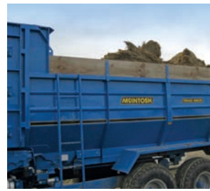
■ Round bales loaded into wagon ready to be fed out